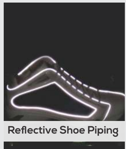
Reflective Shoe Piping