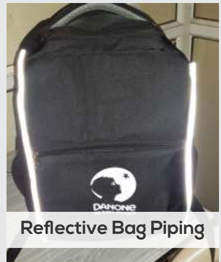
Reflective Bag Piping