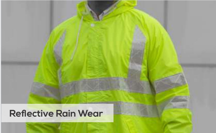
Reflective Rain Wear